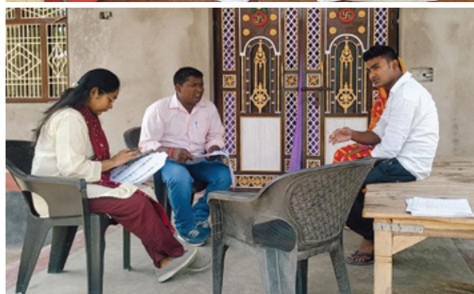
A field day at work for the BLOs